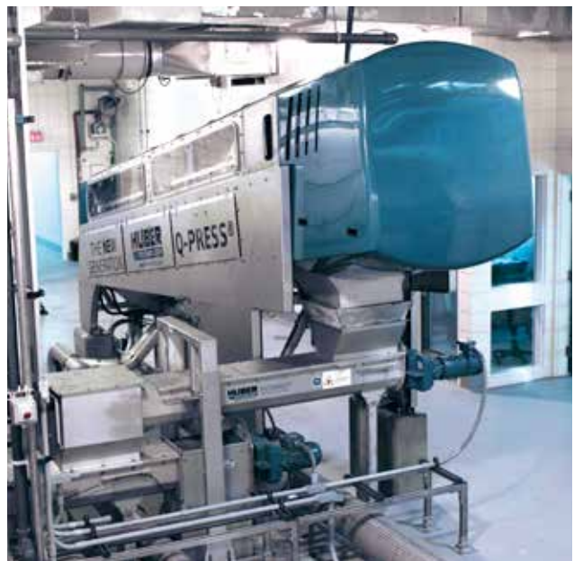
HUBER Screw Press Q-PRESS® 800.2 for 20 m³/h.