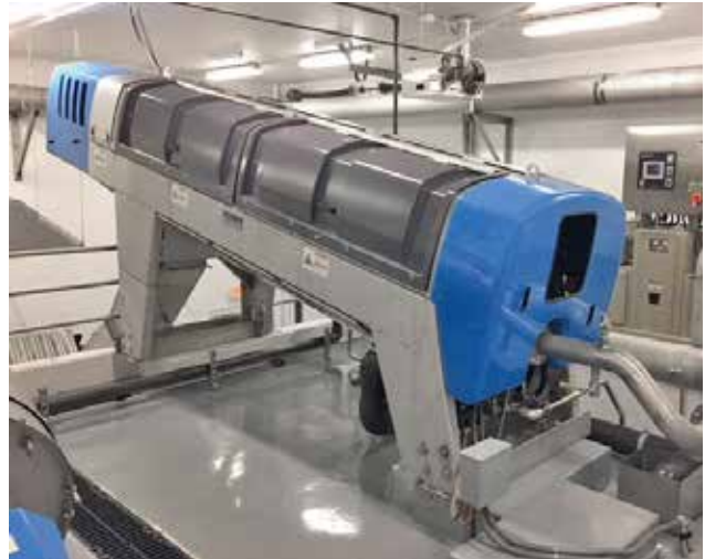
Q-PRESS® 620.2 for surplus sludge dewatering.