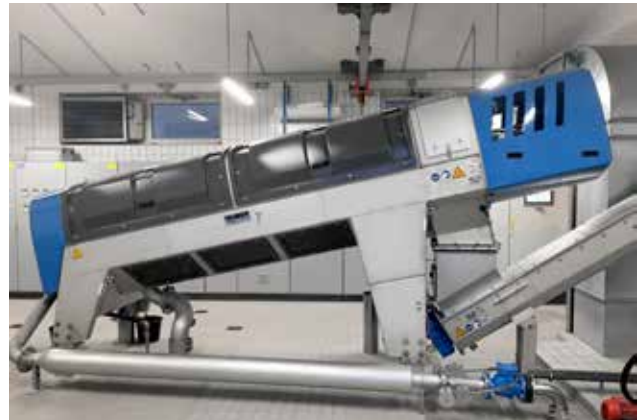
Digested sludge dewatering up to 30% DR.