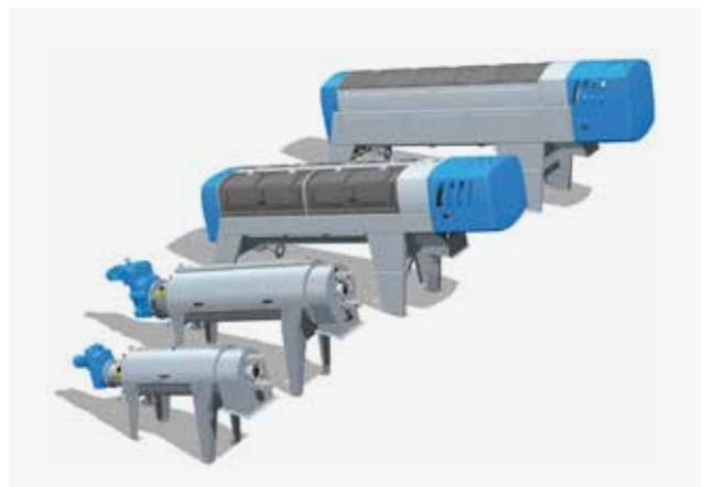
The sizes of the HUBER Screw Press Q-PRESS®.