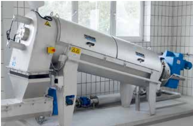
Stationary mounted Q-PRESS® 440.2 for 3 m 3 /h.