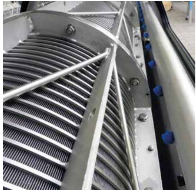
Sturdy wedge wire basket made of stainless steel.