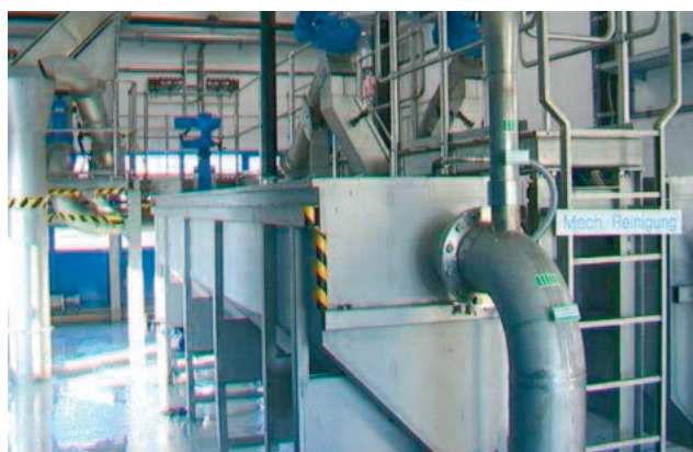
Above-ground redundant installation of a HUBER Longitudinal Grit Trap ROTAMAT® Ro6

Separation of fats and grease is only available when used with aerated grit channels. The grease is collected in a separate chamber with the partition between the grit trap chamber and grease chamber consisting of a slotted scum board. The flow generated within the grit trap chamber by the aeration system transports the grease through the slotted scum board into the grease chamber.