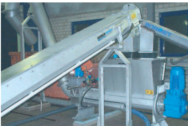
Reliable screenings dewatering with the WAP/HP

The screenings to be treated are discharged directly from a screen or conveyor (e.g. screw conveyor) into the feed trough of the Wash Press. A robust conveying and compacting screw transports the screenings into the wash zone where they are exposed to directed and powerful turbulence created by automatic introduction of wash water (service water). The turbulence achieves perfect separation of organic particles and thus effective screenings washing. The washing intensity and cycles are individually adjustable. The washed screenings are further conveyed in the rising pipe to the press zone where they are intensively pre-pressed by the compacting screw. In the following second press zone the screenings are compacted and dewatered under high pressure to a DS content of up to 60 %. Especially wear-resistant and solid materials in the conical high-pressure unit ensure reliable long-term operation of the plant. The press water from screenings compaction is collected under the high-pressure unit and discharged along with the wash water which is rich in carbon. Automatic cleaning with water of the wear collecting tank under the machine and the complete high-pressure unit is possible. The washed and compacted screenings are finally transported through the conical discharge pipe into a skip.