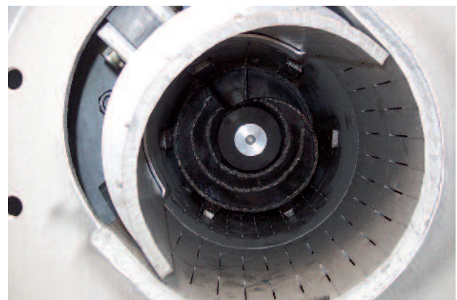
The hydraulic high-pressure unit guarantees a high DR.