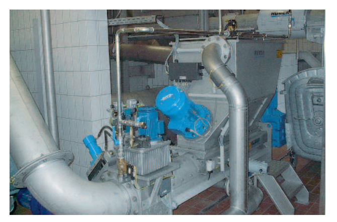
Maximum washing and dewatering results

The washed screenings are further conveyed into the press zone where they are dewatered by means of a sturdy compacting screw. In the following automatically controlled second press zone the screenings are constantly compacted and dewatered under high pressure to a DS content of up to 60 %. Especially wearresistant and solid materials in the conical high-pressure unit ensure reliable long-term operation of the plant. The press water from the screenings compaction is collected under the high-pressure unit and discharged along with the wash water which is rich in carbon. Automatic cleaning with water of the press and wash water collecting tank under the machine and the complete highpressure unit is possible. The washed and compacted screenings are finally transported through the conical discharge pipe into a skip.