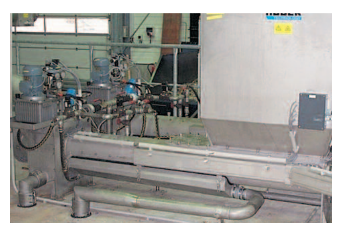
The hydraulic high-pressure unit guarantees a maximum DR.

Subject to technical modification 1,0 / 3 – 8.2010 – 4.2005