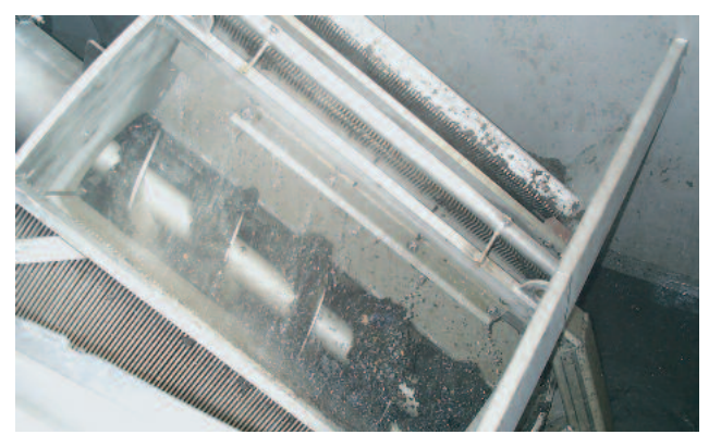
Floating and suspended material is retained in the screen basket. The tines mesh into the basket bars and ensure a complete automatic cleaning.