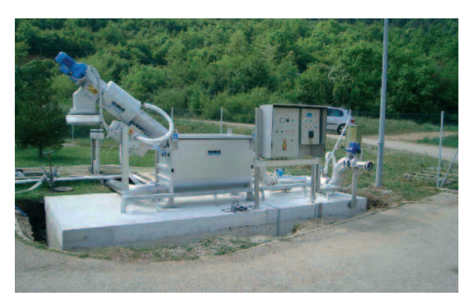
Well-proven mechanical pre-treatment components combined within the ROTAMAT® Sludge Acceptance Plant Ro 3.3

Due to integration of all components in a single tank it is a very compact plant and odour annoyance is prevented. Complete treatment of the septic sludge is performed within a single unit.