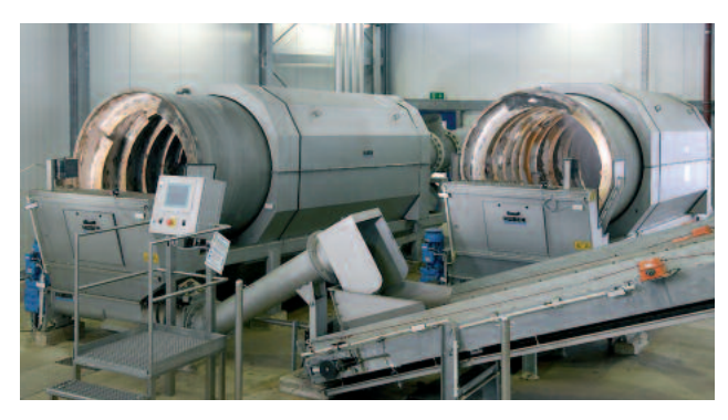
ROTAMAT® Sludge Acceptance Plant RoFAS