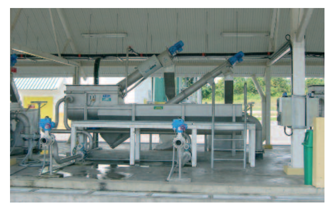
ROTAMAT® Sludge Acceptance Plant with unaerated grit trap and integrated grit classifying screw

Due to integration of all components in a single tank it is a very compact plant and odour annoyance is prevented. Complete treatment of the septic sludge is performed within a single unit.