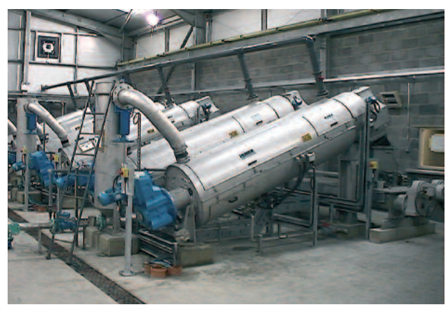
Parallel installation of six HUBER Screw Press S-PRESS units