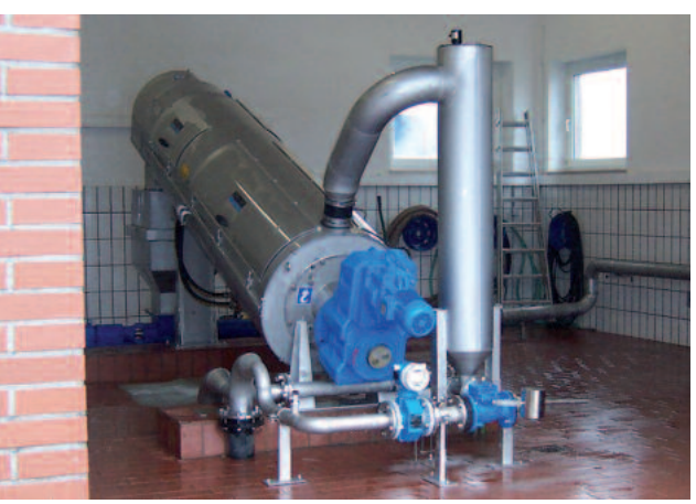
HUBER Screw Press S-PRESS for 8 m3/h