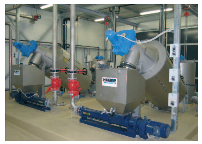
Two HUBER Rotary Screw Thickener S-DRUM units for 80 m<sup>3</sup>/h