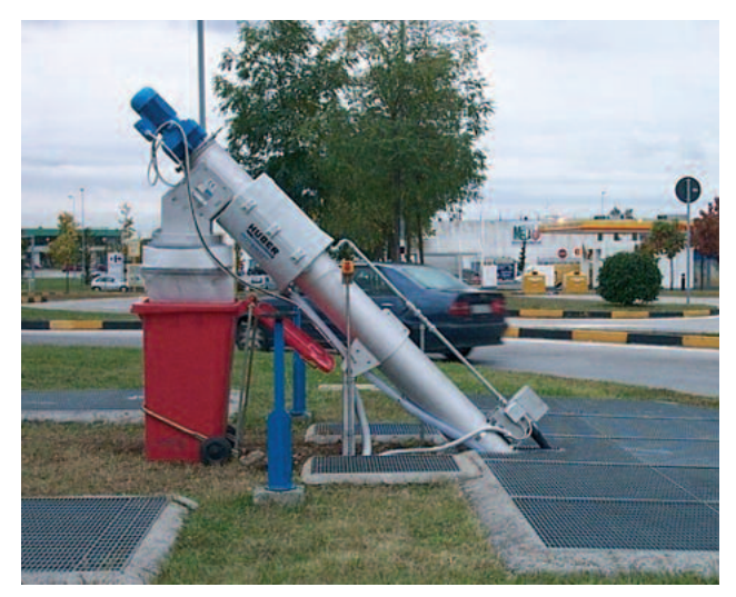
HUBER Micro Strainer ROTAMAT® Ro9 installed in the middle of a roundabout