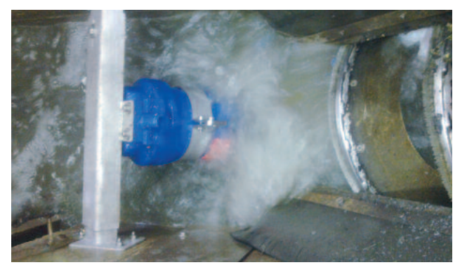
External screenings washing system (ERGA). A preceding washing system washes out the organic matter.