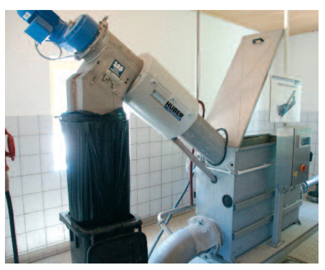
Tank installation of a HUBER Micro Strainer ROTAMAT® Ro9