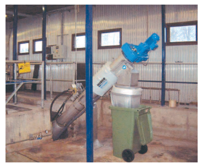
HUBER Micro Strainer ROTAMAT® Ro9 size 700 installed in the channel