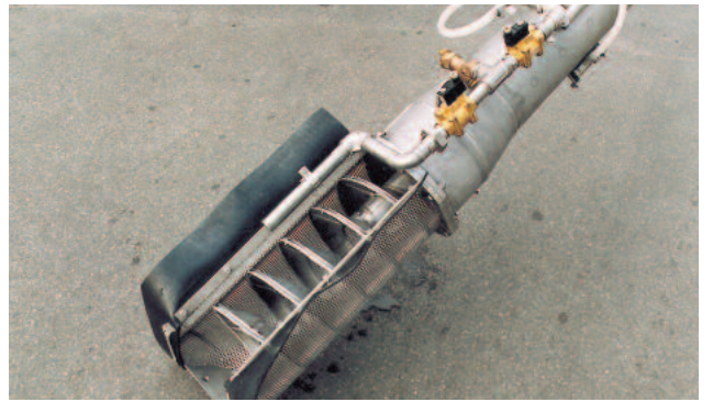
Integrated screenings washing system (IRGA). The ROTAMAT<sup>®</sup> principle allows for integration of the screenings washing system directly in the lower end of the rising pipe.

When the clarification process is to be optimised, the integrated screenings washing system is a well-proven instrument to improve the nitrogen/carbon ratio and save costs. As the soluble matter is separated from the inert material, faeces are virtually completely washed out which leads to a significant weight reduction.