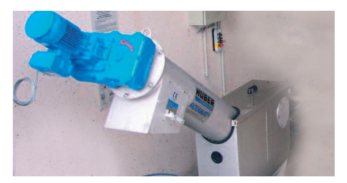
Tank-mounted HUBER Micro Strainer ROTAMAT® Ro9 EC