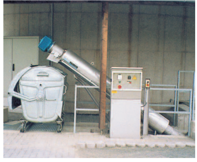
Outdoor installation of a HUBER Micro Strainer ROTAMAT® Ro9