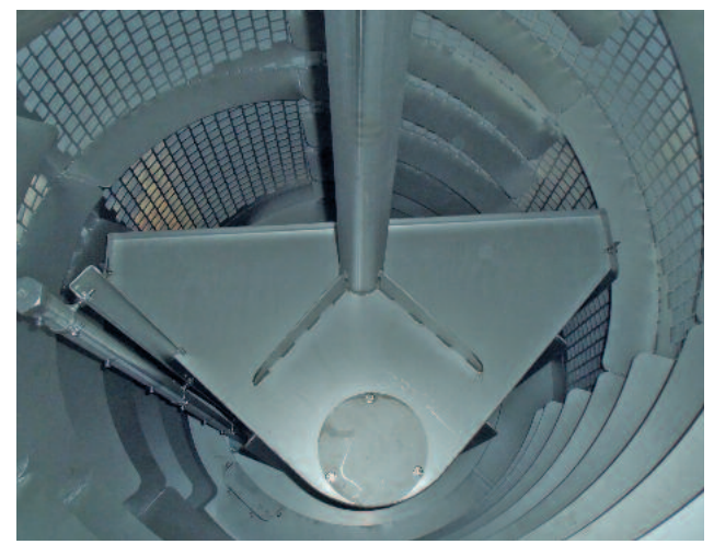
HUBER Drum Screen RoMesh® for optimal separation of very fine particles