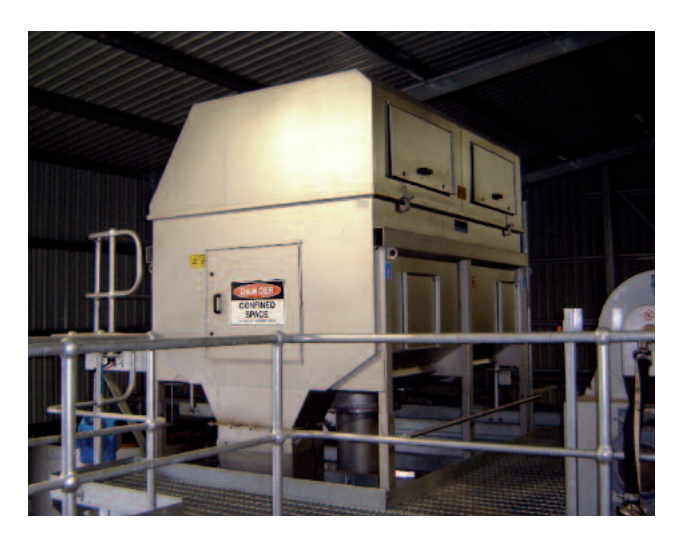
Installation of a HUBER Drum Screen RoMesh® for industrial wastewater treatment