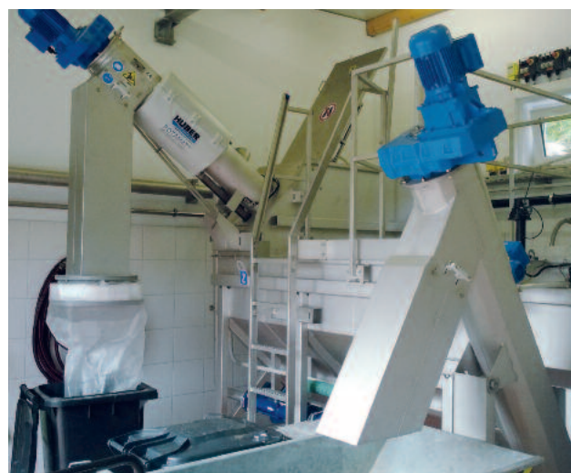
Complete Plant with integrated grit washer