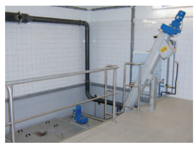
Integrated grit washing at the end of the HUBER Complete Plant ROTAMAT® Ro5