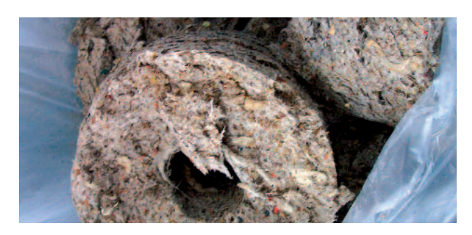
Washed and compacted screenings - the ideal fuel