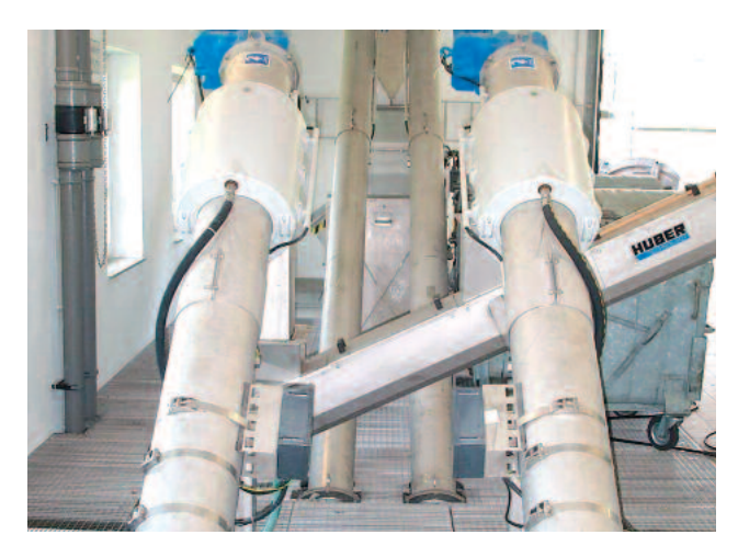
Underground, redundant HUBER Complete Plant ROTAMAT® Ro5