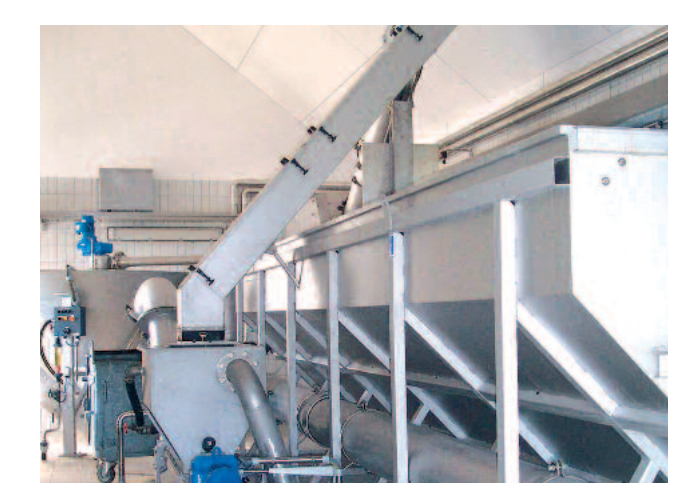
Intensive washing of screenings in a WAP® SL subsequent to a HUBER Complete Plant ROTAMAT® Ro5