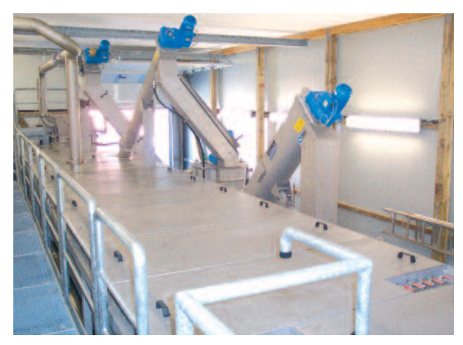
Odour-encased screenings discharge from the HUBER Complete Plant ROTAMAT® Ro5