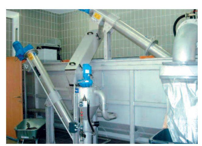
Classifying screw with subsequent HUBER Coanda Grit Washer RoSF4 T

The classified grit slides from the upper end of the inclined screw into a HUBER Coanda Grit Washer RoSF4 T.