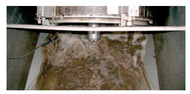
Well-proven wastewater fine screen: HUBER Rotary Drum Fine Screen ROTAMAT® Ro2

Solids concentration of screenings, depending on the WAP® type used: up to 50 % DS.