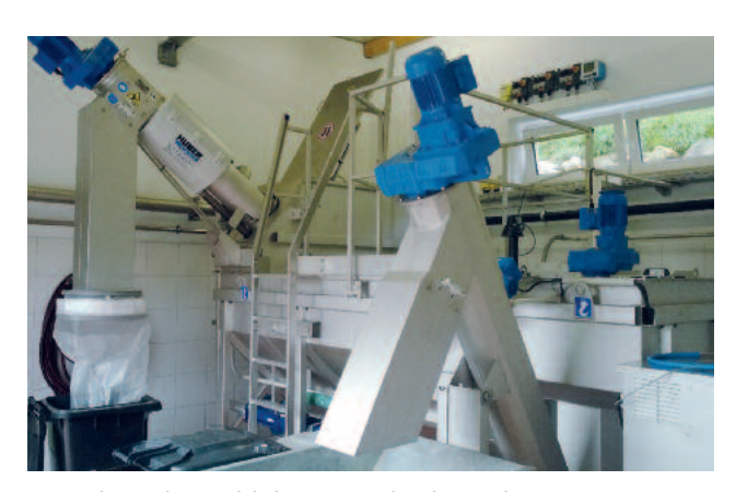
Complete Plant with integrated Grit Washer

Due to a defined introduction of upwardly directed service water the grit situated within the lower part of the grit washer is fluidised within the flow enabling the lighter organic particles to be separated from the dense grit particles. The separation of the lighter organic particles from the dense grit particles is supported by a rabble rake. After removal of the organic material the clean grit is automatically removed by a classifying screw, statically dewatered and discharged into a container.