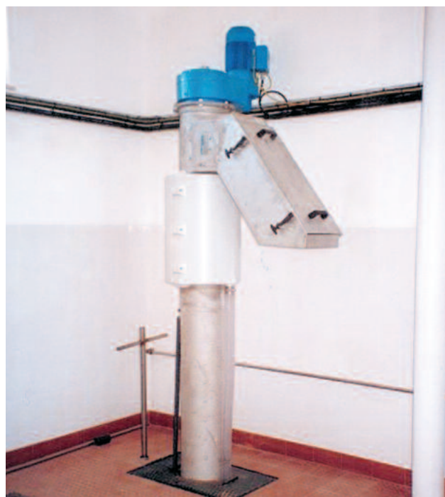
Indoor installation on a small footprint