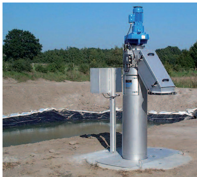
Installation upstream of a pond plant