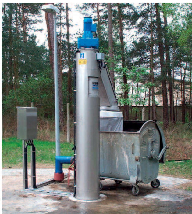
Screenings discharge into a bagger for odour-free disposal