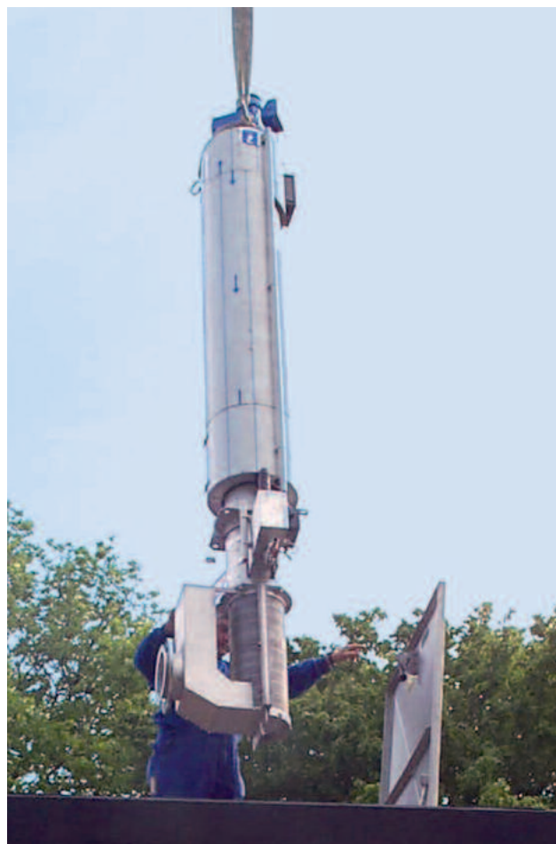
HUBER Pumping Stations Screen ROTAMAT® RoK4 being lifted into a pumping station