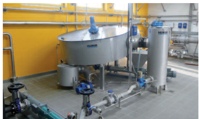
Filtrate storage tank and spray water pump for water recycling