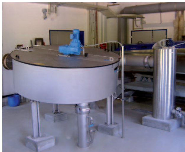
HUBER Disc Thickener S-DISC size 2 with preceding flocculation reactor