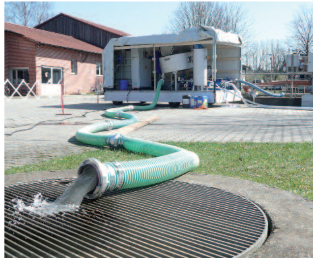
Mobile HUBER Disc Thickener S-DISC mounted on a car trailer, clear filtrate water runs off in the foreground