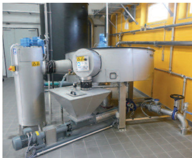
HUBER Disc Thickener S-DISC designed to thicken 35 m 3 /h