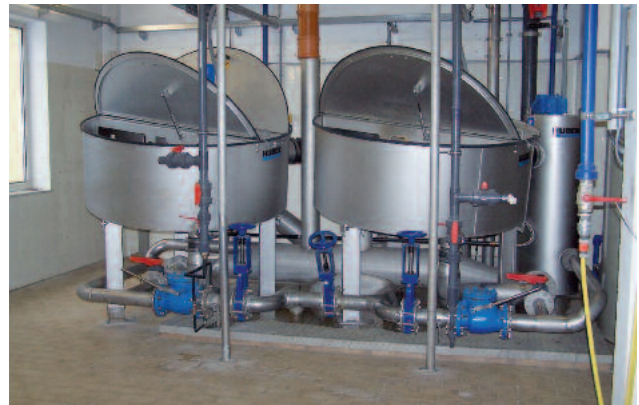
Two units installed in confined space