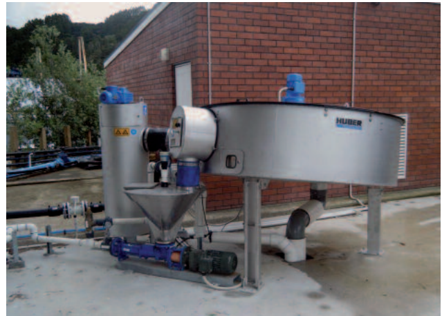
Outdoor installation of a HUBER Disc Thickener S-DISC